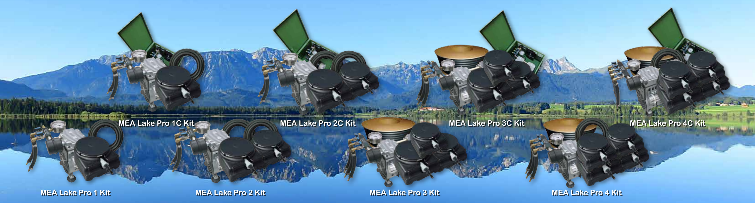
MEA Lake Pro 1C Kit