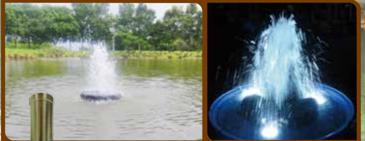
Type D: Gushing