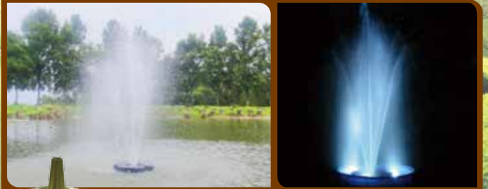
Type B: Multi-jet style